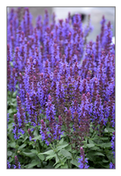
Sensation Sky Blue Meadow Sage flowers