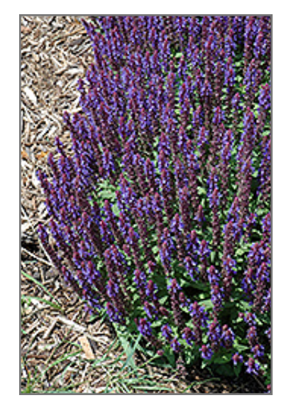
Sensation Sky Blue Meadow Sage flowers

Sensation Sky Blue Meadow Sage is recommended for the following landscape applications;