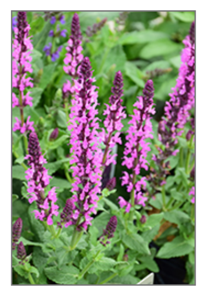
Lyrical Rose Meadow Sage flowers

A bushy variety with stunning spikes of long lasting pink flowers that fade to reveal burgundy calyces, for extended garden color; somewhat drought tolerant; excellent for the sunny border or containers