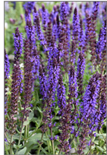
Lyrical Blues Meadow Sage flowers

This is a relatively low maintenance plant, and is best cleaned up in early spring before it resumes active growth for the season. It is a good choice for attracting butterflies and hummingbirds to your yard, but is not particularly attractive to deer who tend to leave it alone in favor of tastier treats. It has no significant negative characteristics.