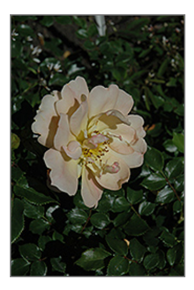
Oso Easy Strawberry Crush Rose flowers