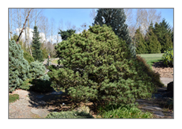
Spaan's Dwarf Shore Pine

This is a relatively low maintenance shrub. When pruning is necessary, it is recommended to only trim back the new growth of the current season, other than to remove any dieback. It has no significant negative characteristics.