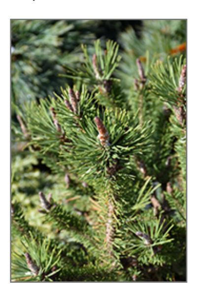
Spaan's Dwarf Shore Pine foliage

Spaan's Dwarf Shore Pine is recommended for the following landscape applications;