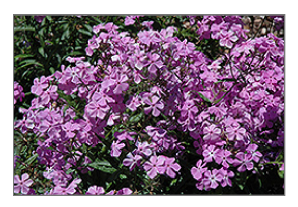
Elizabeth Lawrence Phlox flowers

Other Names: Prairie Phlox, Downy Phlox, Hairy Phlox