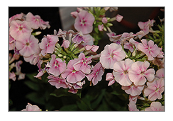
Younique Bicolor Garden Phlox flowers