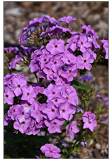
Flame Violet Garden Phlox flowers