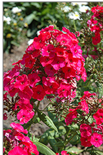
Flame Red Garden Phlox flowers