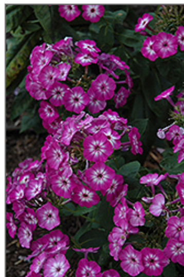
Flame Purple Eye Garden Phlox flowers