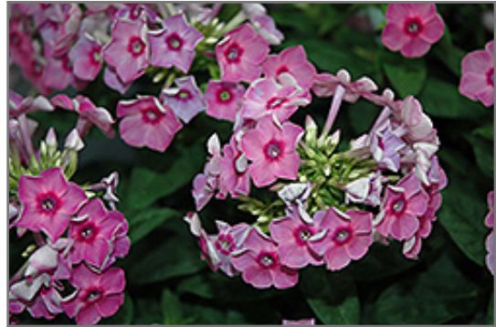
Early Start Dark Pink Garden Phlox flowers