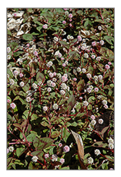
Magic Carpet Knotweed flowers

An interesting groundcover; pointy heart shaped leaves are gray-green, with a burgundy V shaped marking; white button flowers rise on cherry red stems in late summer; an exceptional choice for season-long color