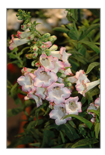
Arabesque Pink Beard Tongue flowers