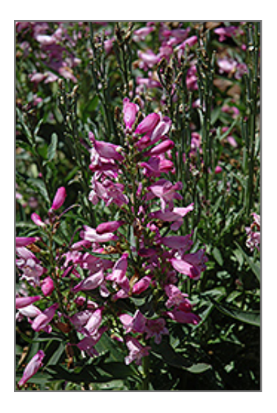
Riding Hood Lavender Beard Tongue flowers