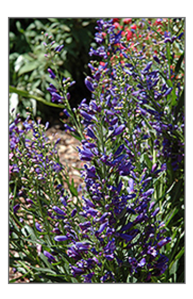
Riding Hood Delft Blue Beard Tongue flowers

An outstanding, contiuously blooming variety with a tidy habit; gorgeous blue-violet flowers rising above green foliage makes a beautiful visual impact when massed in the garden, along walkways, or in borders