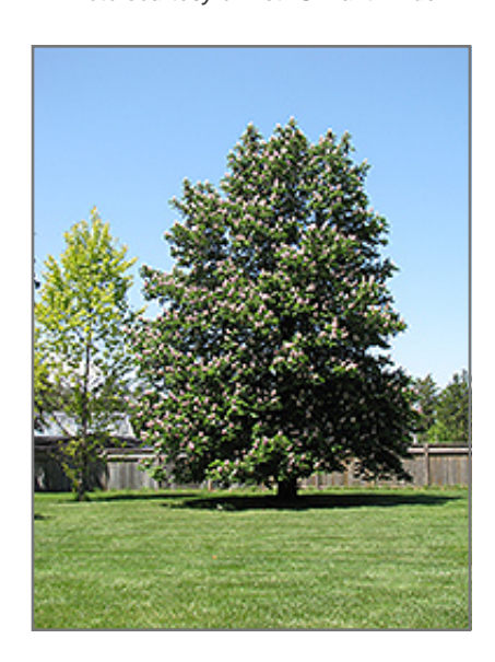
Baumann Horse Chestnut in bloom