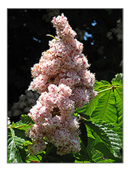
Baumann Horse Chestnut flowers