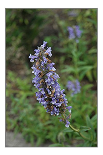
Blue Moon Catmint flowers