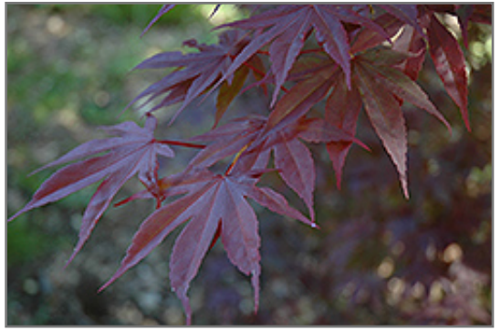
Moonfire Japanese Maple foliage

Moonfire Japanese Maple will grow to be about 20 feet tall at maturity, with a spread of 20 feet. It has a low canopy with a typical clearance of 3 feet from the ground, and is suitable for planting under power lines. It grows at a medium rate, and under ideal conditions can be expected to live for 80 years or more.