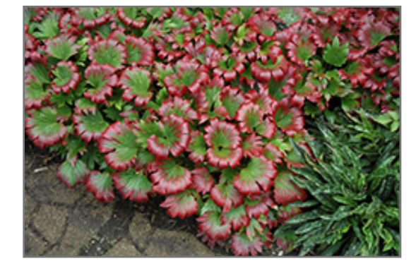
Karasuba Mukdenia

Karasuba Mukdenia features dainty spikes of white bell-shaped flowers rising above the foliage from early to mid spring. Its attractive glossy fan-shaped leaves emerge coppery-bronze in spring, turning dark green in colour with prominent crimson tips throughout the season.