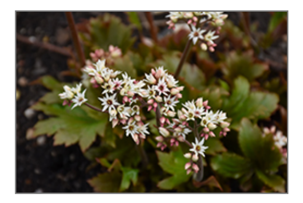
Karasuba Mukdenia flowers