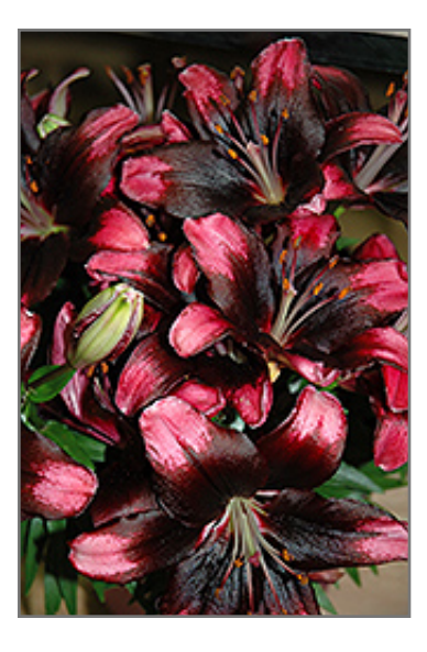
Lily Looks Tiny Poems Lily flowers

This compact variety produces black centered blooms with dazzling pink petal tips; perfect for garden containers, massing, or border plantings; tends to have more blooms per stem than most lilies, which will definitely make an impact in the garden