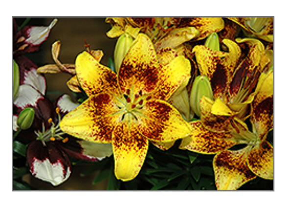
Lily Looks Tiny Nugget Lily flowers