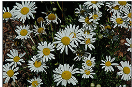
White Breeze Shasta Daisy flowers