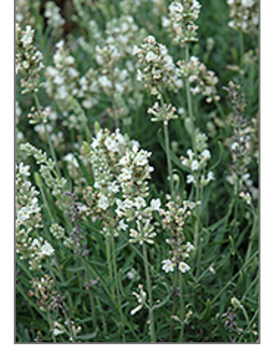
Ellagance Snow Lavender flowers

Plant Height: 12 inches Flower Height: 16 inches Spread: 18 inches Sunlight: O Hardiness Zone: 5a Other Names: English Lavender, Common Lavender Group/Class: Ellagance Series