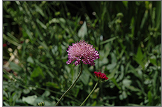
Melton Pastels Scabious flowers