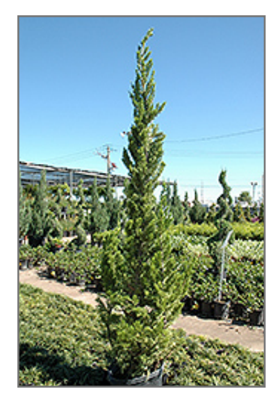
Hollywood Juniper

Hollywood Juniper is a dwarf conifer which is primarily valued in the landscape for its ornamental upright and spreading habit of growth. It has light green evergreen foliage. The scale-like sprays of foliage remain light green throughout the winter. It produces silvery blue berries from mid summer to late winter.