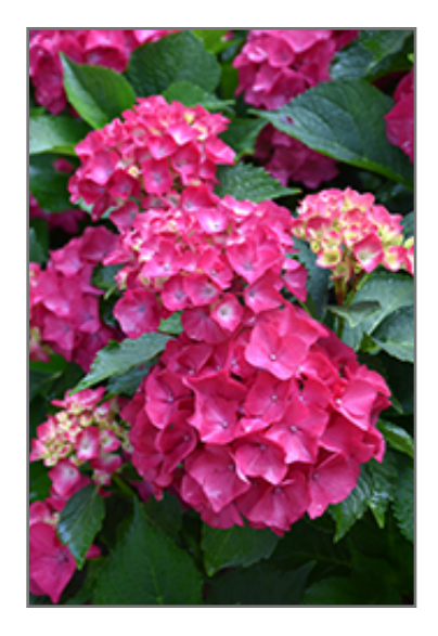
Cityline Paris Hydrangea flowers

Cityline Paris Hydrangea is recommended for the following landscape applications;