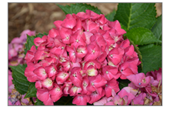
Cityline Paris Hydrangea flowers

This shrub does best in full sun to partial shade. You may want to keep it away from hot, dry locations that receive direct afternoon sun or which get reflected sunlight, such as against the south side of a white wall. It requires an evenly moist well-drained soil for optimal growth. It is not particular as to soil type, but has a definite preference for acidic soils. It is highly tolerant of urban pollution and will even thrive in inner city environments, and will benefit from being planted in a relatively sheltered location. Consider applying a thick mulch around the root zone in both summer and winter to conserve soil moisture and protect it in exposed locations or colder microclimates. This is a selected variety of a species not originally from North America.