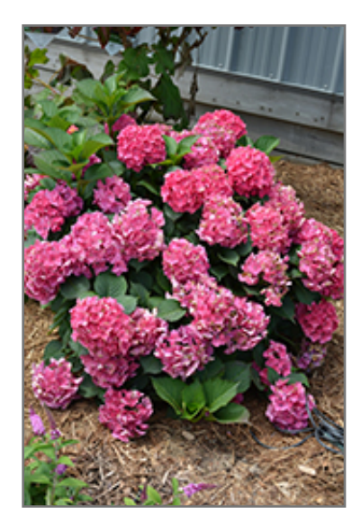
Cityline Paris Hydrangea in bloom