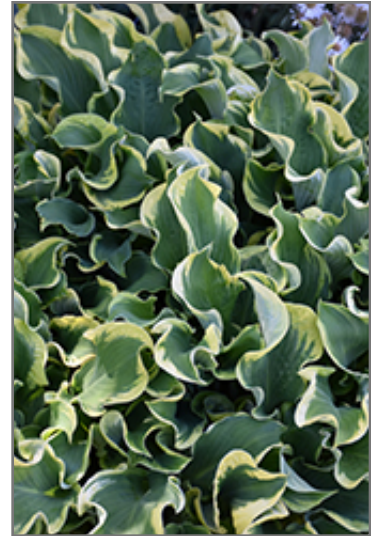
Shadowland Wheee! Hosta foliage