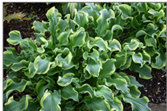
Shadowland Wheee! Hosta