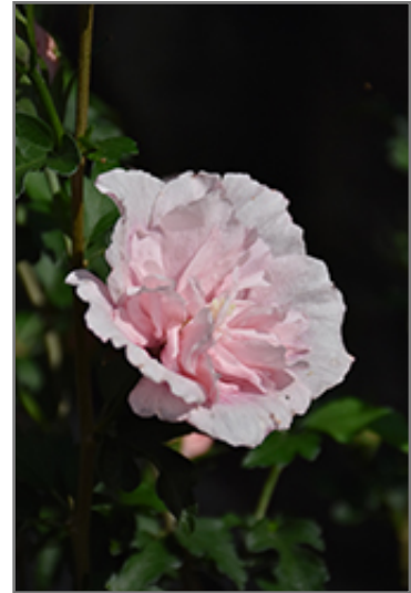
Pink Chiffon Rose of Sharon flowers

Pink Chiffon Rose of Sharon makes a fine choice for the outdoor landscape, but it is also well-suited for use in outdoor pots and containers. Its large size and upright habit of growth lend it for use as a solitary accent, or in a composition surrounded by smaller plants around the base and those that spill over the edges. It is even sizeable enough that it can be grown alone in a suitable container. Note that when grown in a container, it may not perform exactly as indicated on the tag - this is to be expected. Also note that when growing plants in outdoor containers and baskets, they may require more frequent waterings than they would in the yard or garden. Be aware that in our climate, most plants cannot be expected to survive the winter if left in containers outdoors, and this plant is no exception. Contact our experts for more information on how to protect it over the winter months.