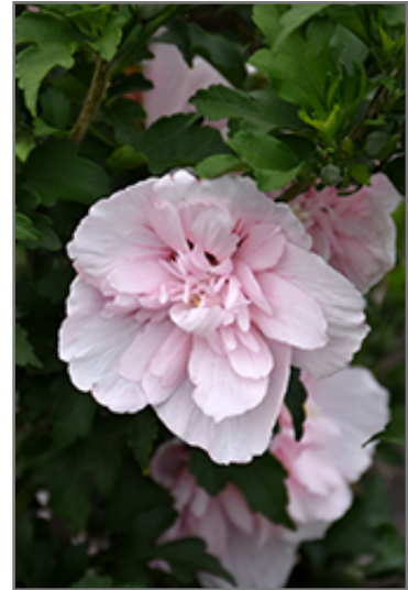
Pink Chiffon Rose of Sharon flowers

Pink Chiffon Rose of Sharon is a multi-stemmed deciduous shrub with an upright spreading habit of growth. Its average texture blends into the landscape, but can be balanced by one or two finer or coarser trees or shrubs for an effective composition.