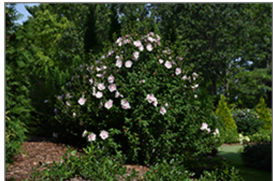
Pink Chiffon Rose of Sharon in bloom