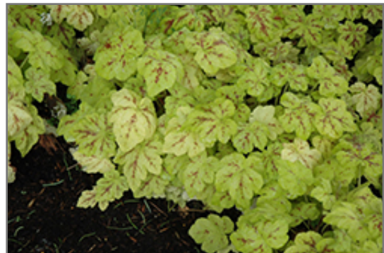
Yellowstone Falls Foamy Bells foliage