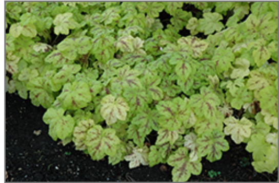
Yellowstone Falls Foamy Bells

Yellowstone Falls Foamy Bells is recommended for the following landscape applications;