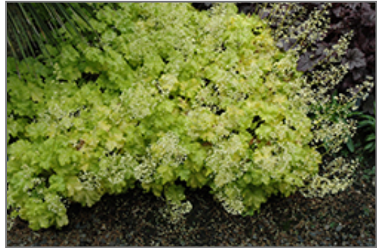
Lime Ruffles Foamy Bells in bloom

Lime Ruffles Foamy Bells is recommended for the following landscape applications;