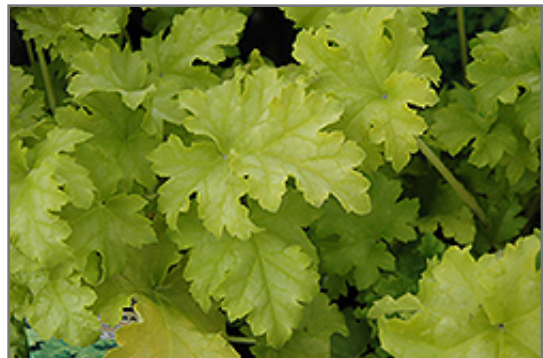
Lime Ruffles Foamy Bells foliage