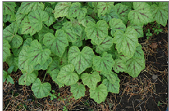
Glacier Falls Foamy Bells foliage

Glacier Falls Foamy Bells is recommended for the following landscape applications;