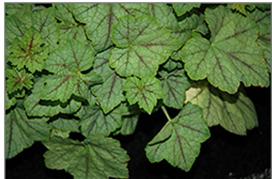
Glacier Falls Foamy Bells foliage