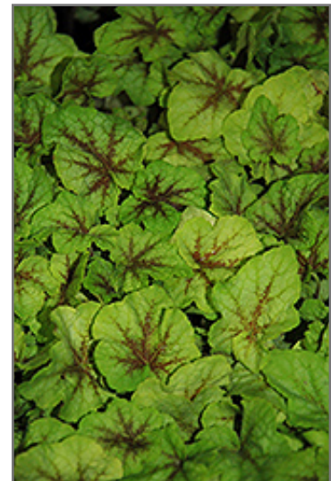
Fire Frost Foamy Bells foliage