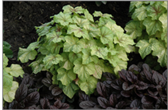
Fire Frost Foamy Bells

Fire Frost Foamy Bells is recommended for the following landscape applications;