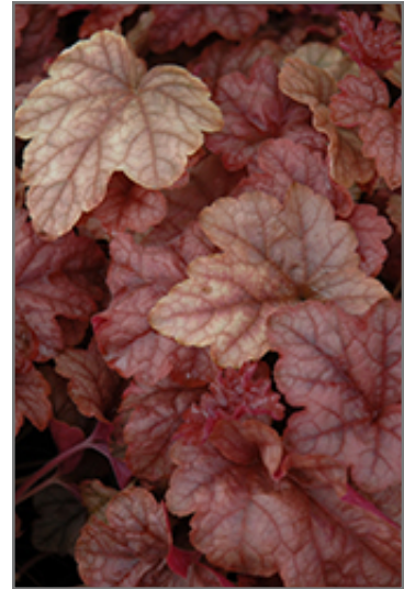
Copper Cascade Foamy Bells foliage