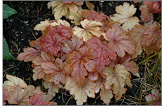
Buttered Rum Foamy Bells

Buttered Rum Foamy Bells is recommended for the following landscape applications;