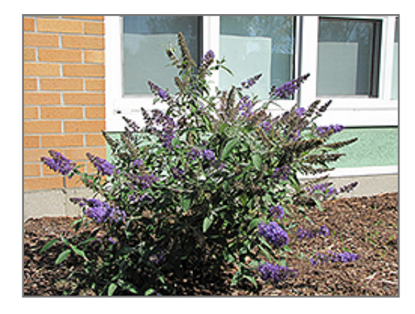
Nanho Blue Butterfly Bush in bloom