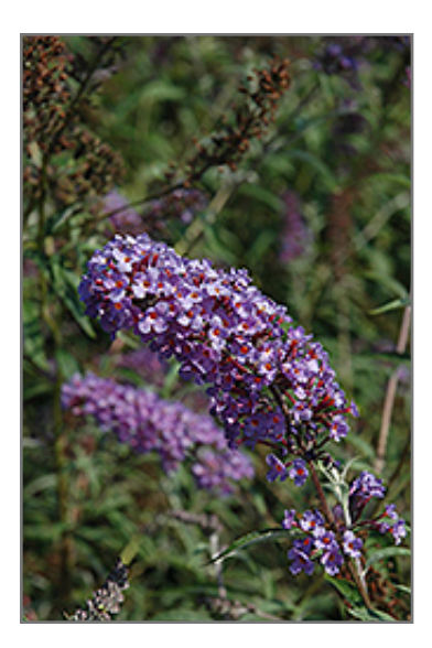
Nanho Blue Butterfly Bush flowers

This is a relatively low maintenance shrub, and is best pruned in late winter once the threat of extreme cold has passed. It is a good choice for attracting bees, butterflies and hummingbirds to your yard, but is not particularly attractive to deer who tend to leave it alone in favor of tastier treats. It has no significant negative characteristics.