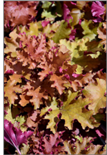
Zipper Coral Bells foliage

Zipper Coral Bells is recommended for the following landscape applications;