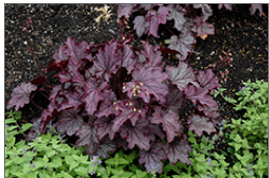
Spellbound Coral Bells