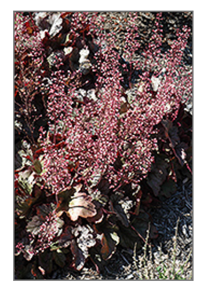
Kira Purple Rain Forest Coral Bells in bloom

Kira Purple Rain Forest Coral Bells is a dense herbaceous evergreen perennial with tall flower stalks held atop a low mound of foliage. Its relatively fine texture sets it apart from other garden plants with less refined foliage.