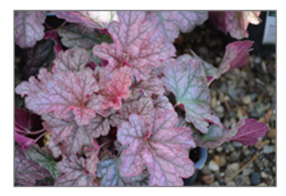
Kira Purple Rain Forest Coral Bells foliage

This is a relatively low maintenance plant, and should be cut back in late fall in preparation for winter. It is a good choice for attracting hummingbirds to your yard. It has no significant negative characteristics.