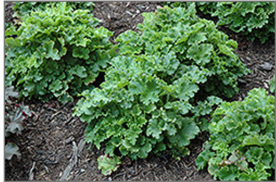
Malachite Coral Bells foliage