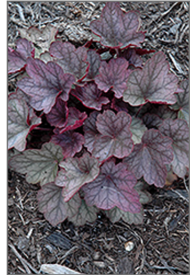
Carnival Rose Granita Coral Bells foliage

Carnival Rose Granita Coral Bells is recommended for the following landscape applications;