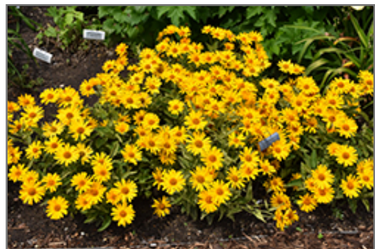
Sunstruck False Sunflower in bloom