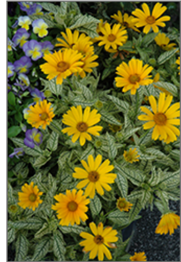
Sunstruck False Sunflower flowers

This plant does best in full sun to partial shade. It is very adaptable to both dry and moist locations, and should do just fine under typical garden conditions. It is not particular as to soil type or pH. It is highly tolerant of urban pollution and will even thrive in inner city environments. This is a selection of a native North American species. It can be propagated by division; however, as a cultivated variety, be aware that it may be subject to certain restrictions or prohibitions on propagation.