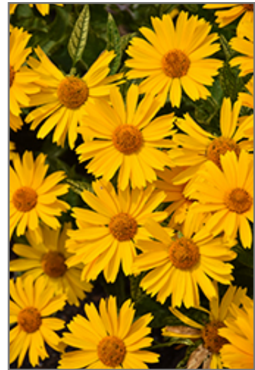
Sunstruck False Sunflower flowers

This is a relatively low maintenance plant, and is best cleaned up in early spring before it resumes active growth for the season. It is a good choice for attracting butterflies to your yard. It has no significant negative characteristics.