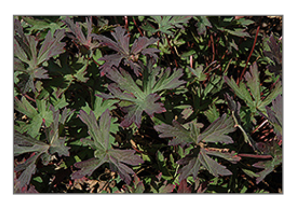
Midnight Clouds Cranesbill foliage