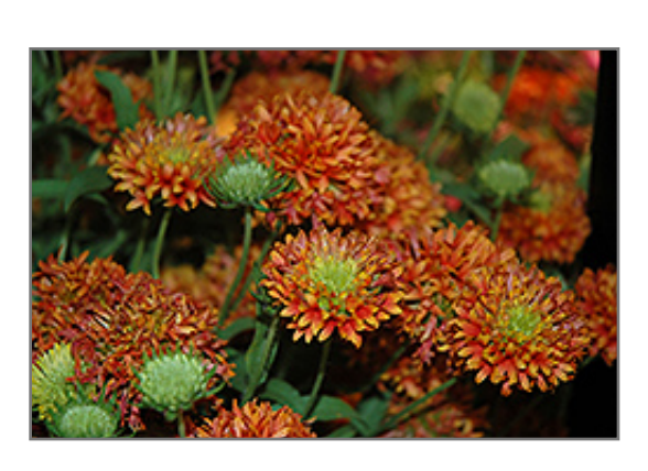
Galya Orange Spark Blanket Flower flowers

This fine textured variety has stunning orange-coral daisy-like flowers with chartreuse centers; prefers moist, rich sites but will adapt to dry sites; deadhead to promote re-blooming; good for naturalizing