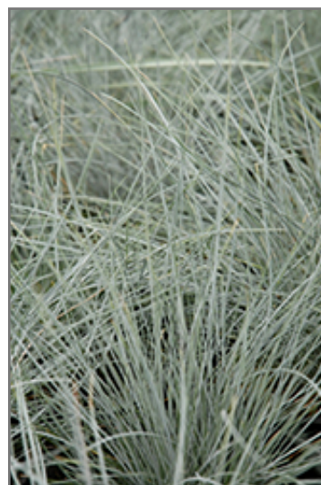
Beyond Blue Blue Fescue foliage