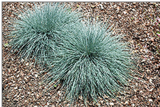
Beyond Blue Blue Fescue

Beyond Blue Blue Fescue is recommended for the following landscape applications;