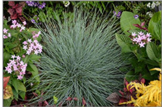
Beyond Blue Blue Fescue

Beyond Blue Blue Fescue will grow to be about 12 inches tall at maturity, with a spread of 18 inches. Its foliage tends to remain dense right to the ground, not requiring facer plants in front. It grows at a medium rate, and under ideal conditions can be expected to live for approximately 8 years. As an evergreen perennial, this plant will typically keep its form and foliage year-round.