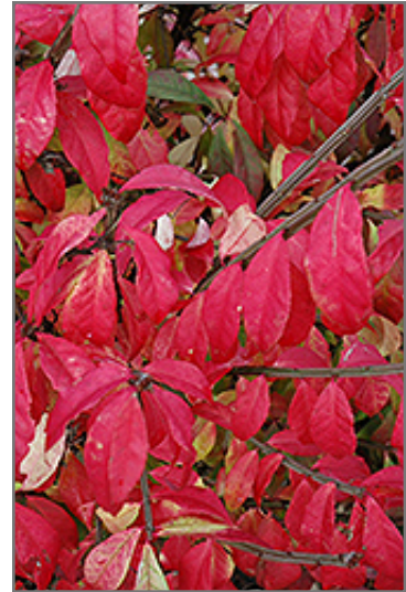
Fire Ball Burning Bush in fall

This shrub performs well in both full sun and full shade. It is very adaptable to both dry and moist locations, and should do just fine under average home landscape conditions. It is not particular as to soil type or pH. It is highly tolerant of urban pollution and will even thrive in inner city environments. This is a selected variety of a species not originally from North America.