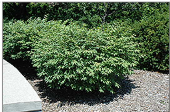
Fire Ball Burning Bush