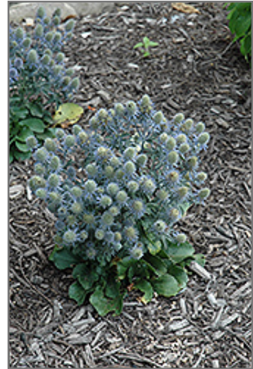
Tiny Jackpot Sea Holly