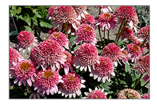
Butterfly Kisses Coneflower flowers