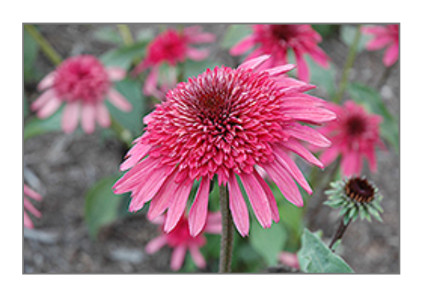
Supreme Elegance Coneflower flowers

Stately double blooms of hot pink, with deep rosy-red centers on strong stemmed, well branched plants; attracts pollinators and feeds the birds in winter; use in naturalized areas with other native plants