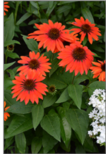
Sombrero Flamenco Orange Coneflower in bloom

Sombrero Flamenco Orange Coneflower is recommended for the following landscape applications;