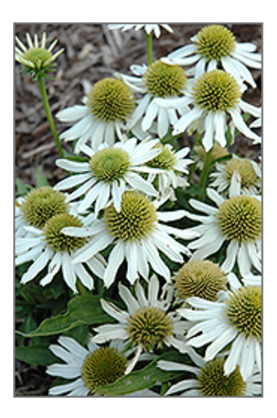
Snow Cone Coneflower flowers